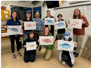
Gyotaku Fish Printing

The meeting continued with presentations on a variety of topics followed by a casual social at the Aquarium of the Pacific before heading into the poster session. This was a full meeting with 3 days of over 100 presentations, 30 poster presentations and over 190 attendees! There were so many incredible student talks and posters with the student winners listed below.