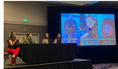
Early Career Scientists Panel