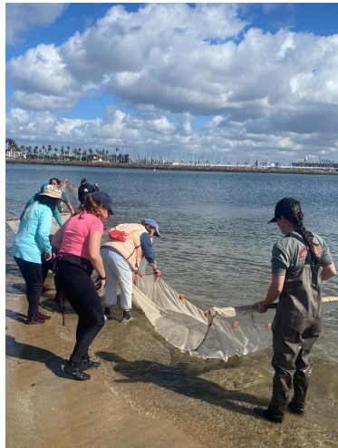
SoCal Fishes Beach Seine