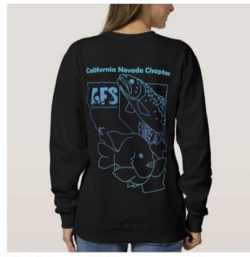
Cal-Neva AFS sweatshirt