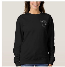
Cal-Neva AFS sweatshirt