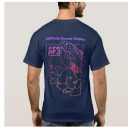
Basic Dark T-Shirt