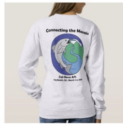
Cal-Neva Connecting the Mo...