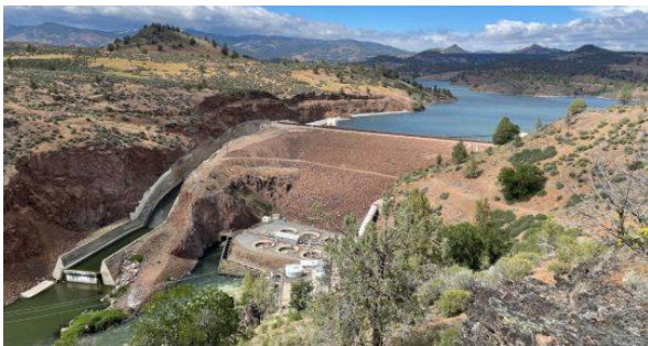
Iron Gate Dam

The theme of the 2024 meeting is “Breaching the Dam: Building Partnerships.” We will bring together people of diverse backgrounds and expertise to tell the stories about the resilience of Native American tribes, competing interests in a water-limited environment, and of native ecosystems and fishes in the face of significant hydrologic perturbations and uncertainty. In doing so, we hope to achieve and learn from others who have experienced conservation success and find applicable ways for people and the natural world to flourish together.